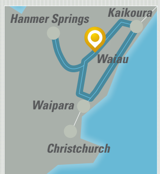
ALPINE PACIFIC TRIANGLE TOURING ROUTE

HANMER SPRINGS 59KM ROTHERHAM 10KM CULVERDEN 22KM